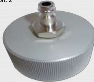
Part No: G49 Fitment: Brake. 43.5mm ID

Ford Courier, Econovan, Laser, Mazda 323, 626, B series