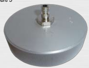
Part No: G75 Fitment: Brake. 78mm ID

Mitsubishi Galant, Lancer, Pajero, Triton Proton