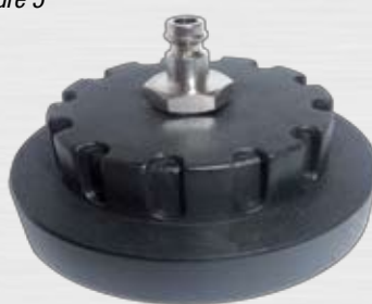
Part No: NISLARGE Fitment: Brake

Ford Corsair, Nissan Maxima, Micra, Navara, Pintara, Patrol