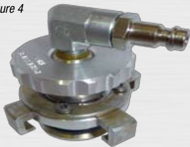
Part No: IHCA Fitment: Clutch. 33mm ID

Hino Trucks (Most), Holden Jackaroo, Rodeo Isuzu Trucks (Most), Nissan Navara, Patrol Subaru Brumby, L series Brake