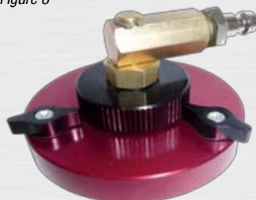
Part No: PPBA10 Fitment: Brake. 42mm ID