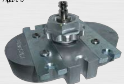
Part No: PBroVAL Fitment: Brake

Ford Falcon, Territory, Holden Commodore Mitsubishi Magna