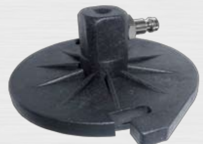
Part No: UCA85P Fitment: Brake & Clutch