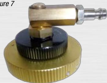
Part No: PPBA03 Fitment: Brake

Ford Escape, Explorer, Holden Commodore VZ, VE, Most Hyundai, Nissan Patrol GU, Pulsar, Tiida, Subaru Forester, Impreza, Liberty