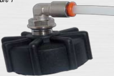
Part No: E20W Fitment: Brake

Most European vehicles, Daewoo 1.5, Cielo, Espero, Kalos, Lanos, Leganza, Ford Transit, Kia Sportage, Holden Apollo, Astra, Vectra